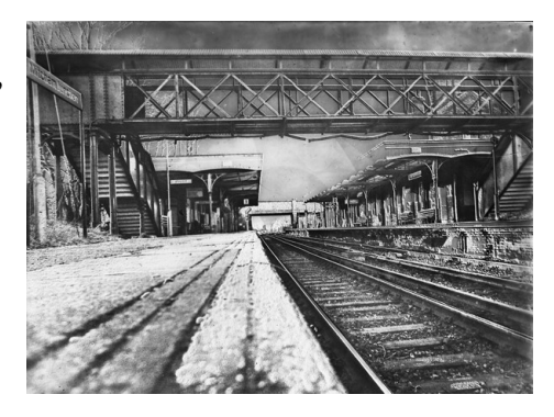
Mitcham Junction Station in 1983

For my first 4 years here I was still at school, so every morning I had to catch the train from Mitcham Junction Station, standing on the platform alongside hundreds of boxes of watercress and salad from Mizen's heading for Covent Garden market.